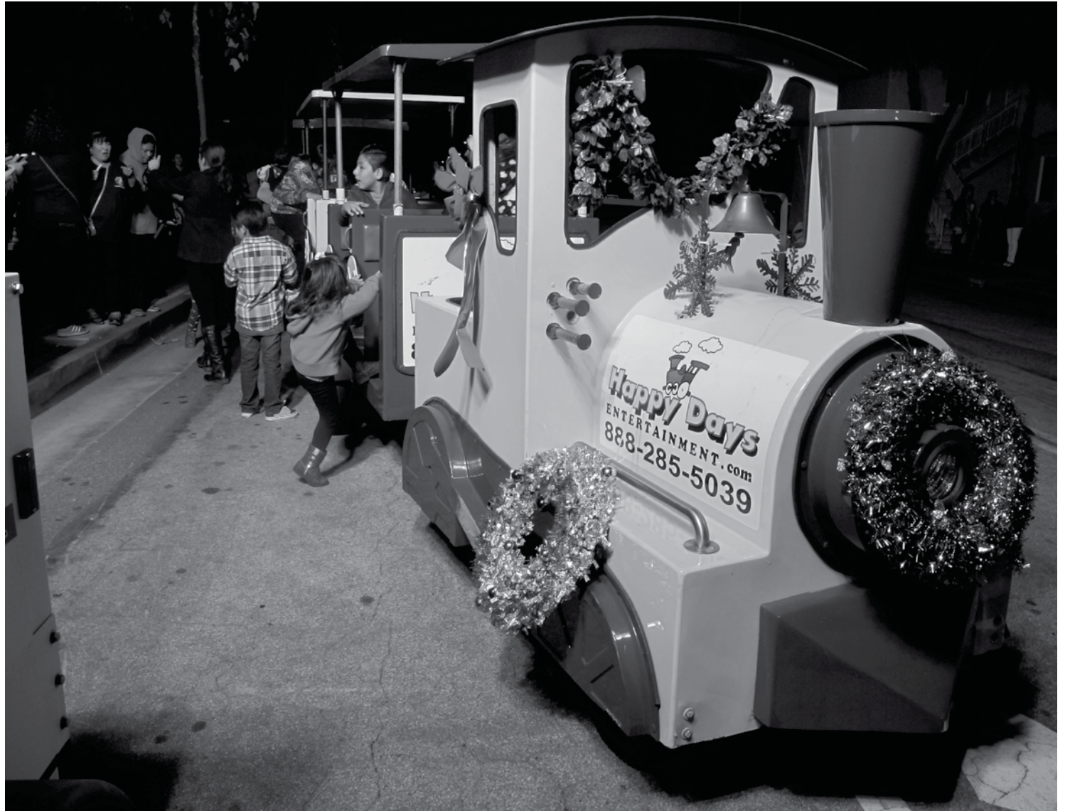
Parents and children enjoy the Happy Days train ride during the annual angel tree lighting ceremony. Families packed the intersection of Burin Avenue and 147th Street for the Dec. 2 event. The train rides were free to attendees as were the music and a visit from Santa Claus.